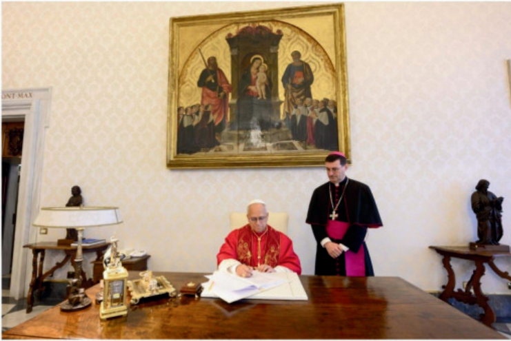
Pope Leo XIV signs "Magnifica humanitas"