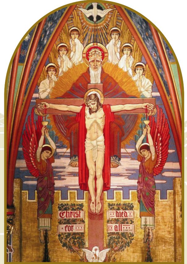
CENTRAL PANEL AT THE CATHEDRAL OF THE MADELEINE IN SALT LAKE CITY PAINTED BY FELIX LIEFTUCHTER IN 1918

Weddings – Contact the parish office at least six months in advance.