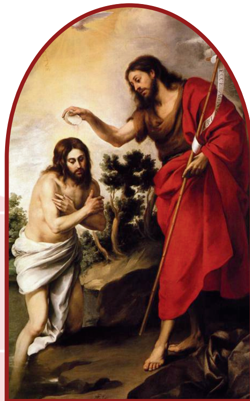
BARTOLOME MURILLO. BAPTISM OF THE LORD, OIL ON CANVAS, 1655.

Weddings: Contact the parish office at least six months in advance.