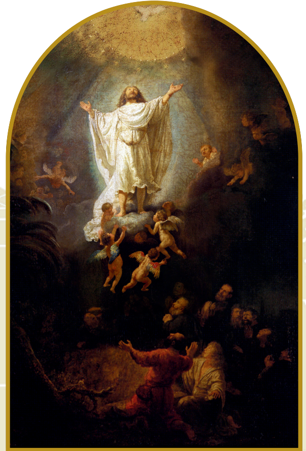
REMBRANDT – THE ASCENSION OF CHRIST (1636)

Weddings – Contact the parish office at least six months in advance.