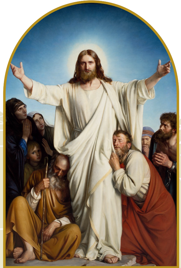
CHRISTUS CONSOLATOR BY CARL HEINRICH BLOCH (1834-1890)

Weddings – Contact the parish office at least six months in advance.