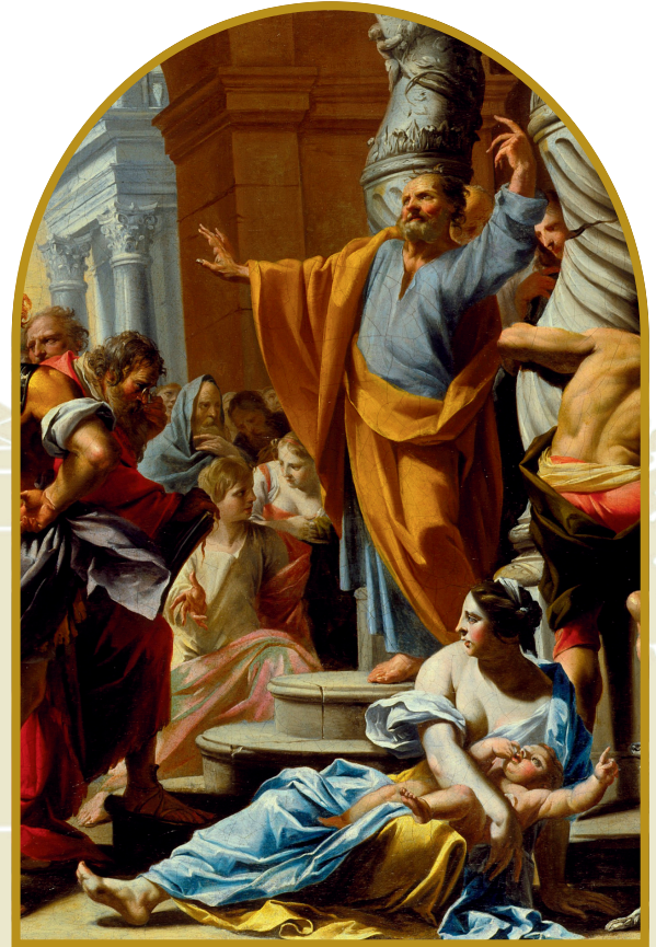
THE PREACHING OF ST. PETER IN JERUSALEM BY CHARLES POËRSON (1642)

Weddings – Contact the parish office at least six months in advance.