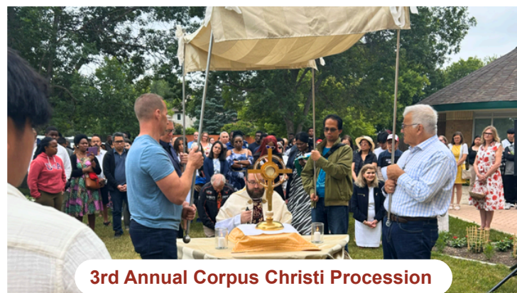
3rd Annual Corpus Christi Procession