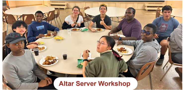
Altar Server Workshop