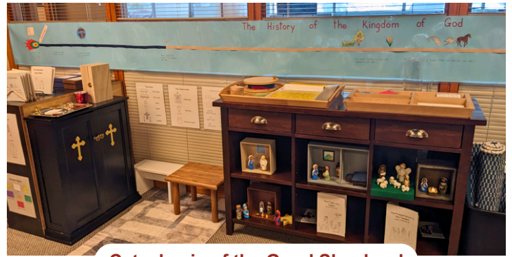
Catechesis of the Good Shepherd