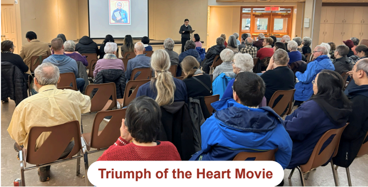
Triumph of the Heart Movie