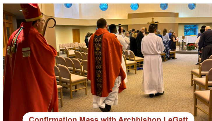
Confirmation Mass with Archbishop LeGatt