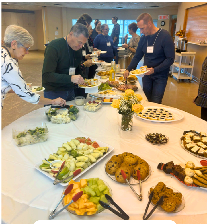
Alpha & RCIA/Adult Faith Formation