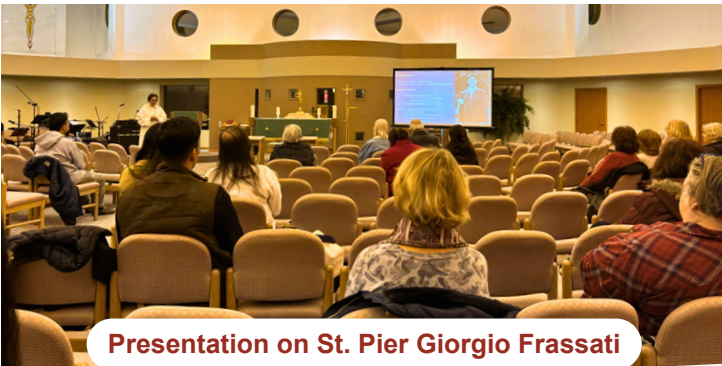
Presentation on St. Pier Giorgio Frassati