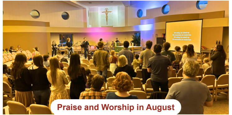
Praise and Worship in August