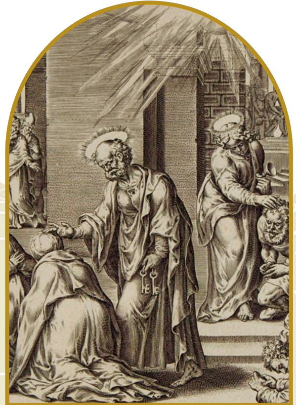
ST. PETER, ST. JOHN AND ST. PHILIP LAYING THEIR HANDS ON THE BAPTIZED AT SAMARIA 1575 PRINT BY MAARTEN VAN HEEMSKERCK

Weddings – Contact the parish office at least six months in advance.