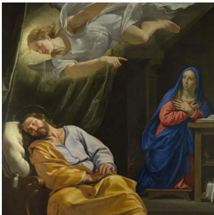
The Dream of Saint Joseph, Painted by Philippe de Champaigne (1602-1674), Painted in 1642

"Look, the virgin shall conceive and bear a son, and they shall name him Emmanuel," which means, "God is with us." Matthew 1:23