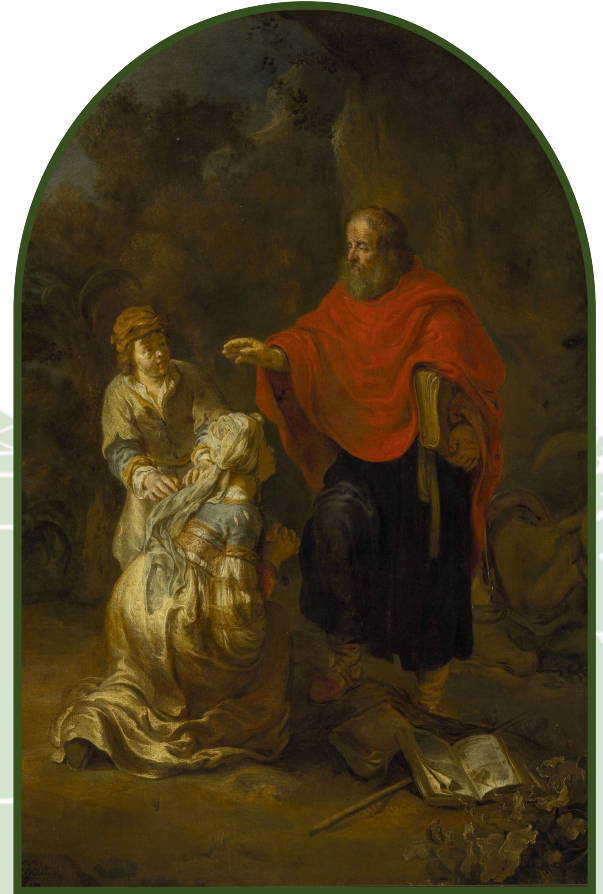
THE PROPHET ELISHA AND THE WOMAN OF SHUNEM (1664) BY GERBRAND VAN DEN EECKHOUT

Weddings – Contact the parish office at least six months in advance.